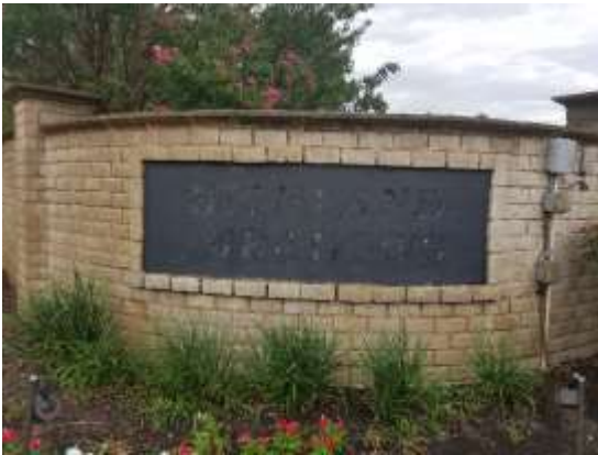
Old entrance sign showing missing brass letters

ENTRANCE SIGN PROJECT UPDATE: We are pleased to announce the installation of all monument signs at our entrances is complete! For those of you new to Highland Meadows, 4 of the entrance signs were vandalized and the brass letters stolen in August 2018. The HM HOA Board decided to take the opportunity to speed up the planned update to the look on our entrance signs, taking advantage of funds received from insurance coverage on the vandalism. With several weather, manufacturing and installation set-backs, we are happy to declare that the project is complete. Total cost of the entrance sign project was $77,665.00, with $32,857.14 of that coming from our insurance coverage due to the vandalism. The total cost from HOA Reserves was $44,807.86. During the repairs, additional wall damage was discovered, with repairs needed on Sections 1 & 7; and on the South side of the Whitehaven/Pool Rd entrance due to tree roots that had cracked and lifted the entrance sign foundation. Landscape Committee members are keeping track of existing cracks in several wall panels, which will be repaired should they worsen. The landscape plants at the entrances on Hall Johnson have been updated. Our next project is to change out the plants on the three Pool Road entrances to match the plant selections on Hall Johnson. Our thanks to Ray Allee and Wall & Landscape Committee members Joe Buchanan & Ron Ziolkowski for their diligence in working on this project.