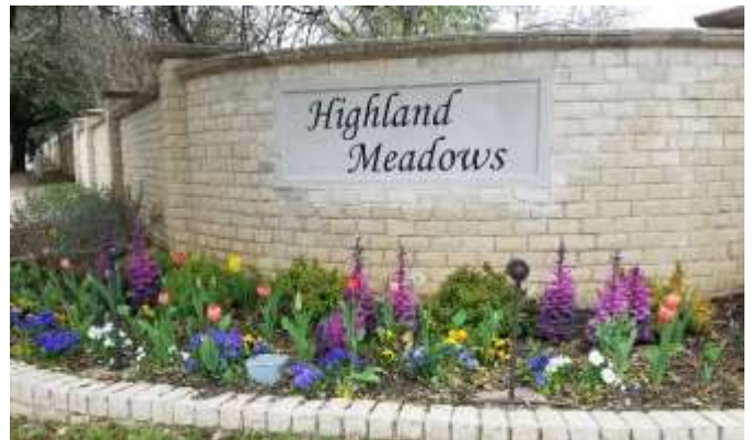
New entrance signs with spring flowers

The GCISD Board of Trustee Election, for the purpose of electing a Trustee for Place 5, Place 6 and Place 7, will be held on November 3, 2020 .